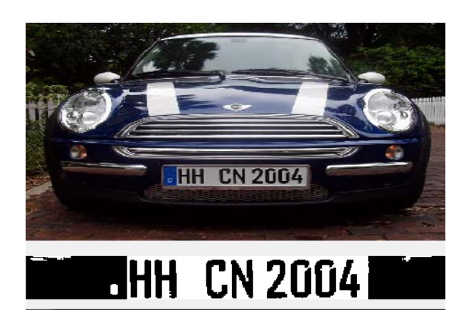
Figure 6. Character Extraction