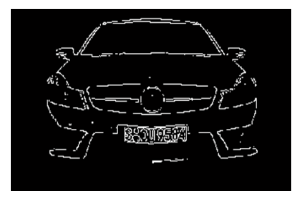
Figure 5.Edge Detection

information, while preserving the important structural properties in the image. There are several edge detection methods used for example error minimization, maximization object function, fuzzy logic, morphological, genetic algorithm, neural network and Bayesian approach.