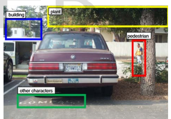
Figure 1.Background clutters are common and license plate region is small.

conditions. For example, some of these systems