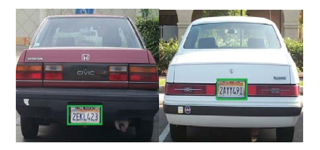
Figure 4. License Plate Detection

Candidate Region Generation: After vehicle detection, we localize license plate in each region. For this, first we need to generate candidate region and apply CNN based classifier for each candidate. In order to generate candidate region, we adopt hierarchical sampling method that repeats greedy pairwise merging procedure until one global region remains. All regions that appeared in merging process are considered as candidate regions. The area of candidate region in the image is calculated as a feature extracted and it is given as total number of pixels in the candidate regions. The candidate region is generated and it overcomes the problem by avoiding the noise.